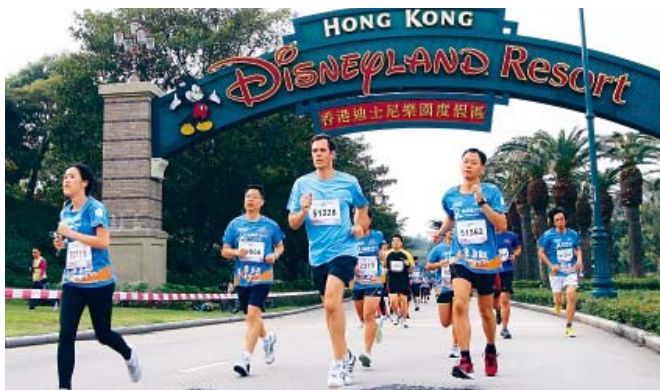
■Fully supported by the Hong Kong Disneyland Resort, the Charity Run will take place at the Hong Kong Disneyland Resort and Sunny Bay, where runners can enjoy magnificent scenery along the route.