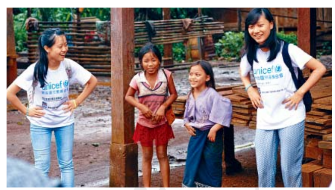
■AEON Credit Service (Asia) Co. Ltd has sponsored Young Envoys Programme for nine consecutive years, fostering children to explore the world, and become a new force in promoting children's rights.