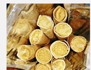
■The 'crispy wafers' will be launched in Cambodia this year and next.

In Cambodia, 10 per cent of the children aged under 5 are severely malnourished. UNICEF discovered that Cambodians love snacks, but their snacks contain high sugar content and not much else. Thus, they collaborated with researchers and local social enterprises to create a low-cost and tasty snack made from nutritious fish and rice. It is packaged as inexpensive 'crispy wafer'. Children from an urban slum, aged between 2 and 7, were invited to be little taste-testers to make it more palatable. This 'crispy wafer' will be available across the country this year and next. Researchers continue to refine and carry out testings, hoping to come up with a flavour that is also attractive to pregnant women and nursing mothers to improve children's health comprehensively.