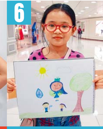
I hope every child will have clean drinking water!