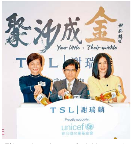
■TSL organizes a three-year fundraising campaign with a goal to raise at least HK$2.4 million to support UNICEF's effort in improving water supply and sanitation for schools and families in rural China. Learn more: unicef.org.hk/en/TSL