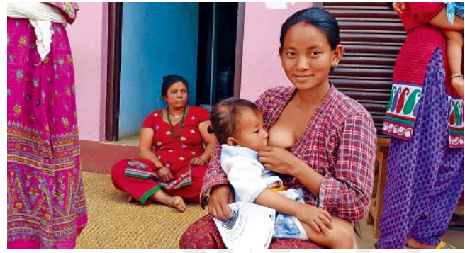
■Research papers published by The Lancet point out that improving breastfeeding practices could save the lives of over 820,000 children.