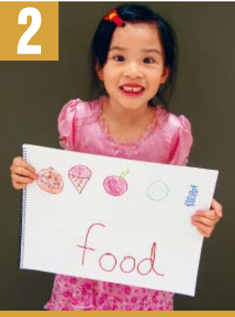
I hope no child goes to bed Edith Pang, 6