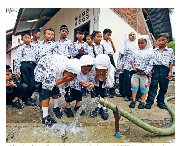
■After the South-East Asia tsunami in 2004, UNICEF has rebuilt schools and re-established water and sanitation facilities at the campus in Aceh of Indonesia.