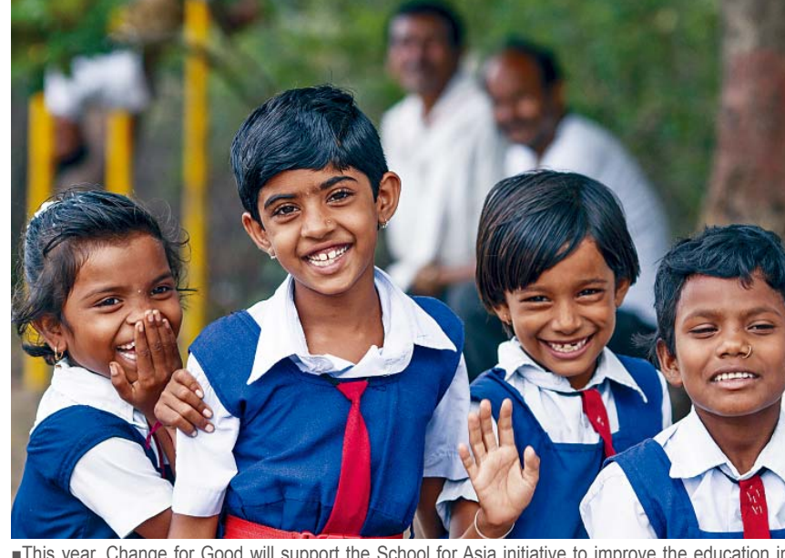
■This year, Change for Good will support the School for Asia initiative to improve the education in India and China.

programme will earmark 30 per cent of the annual donation improving education in China and India, through the platform of Schools for Asia.