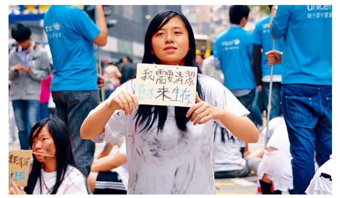
■UNICEF has nurtured nearly 2,800 youngsters to become child rights advocates.

"Our education should fit not only for most, but for all." said Harrison. He stood up for minority students on equal education opportunity, hoping