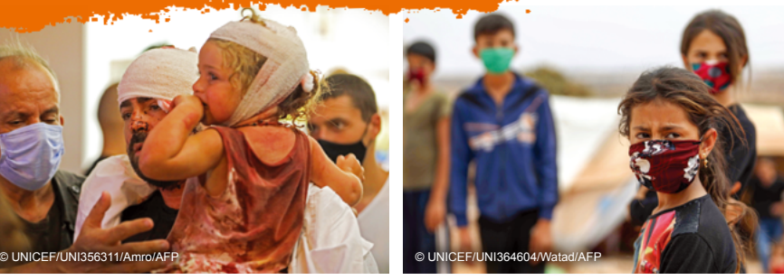
Children are facing more devastating wars and natural disasters than ever before.